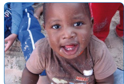
Enjoying the new sand pit!