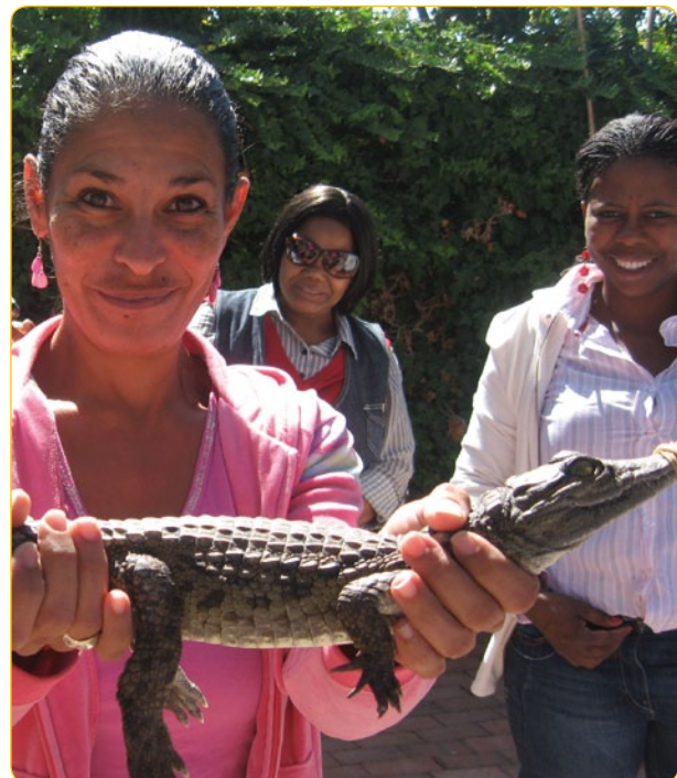
Moms also got to play!