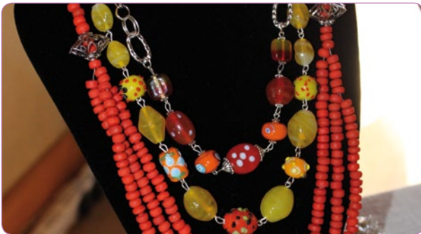
Accessories made by our residents, for sale at St Anne's Homes.