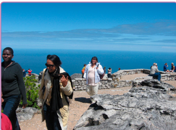
Visit to Table Mountain and the Mount Nelson Hotel

48 Balfour Street Woodstock 7925 Cape Town • PO Box 43363 Woodstock 7915 South Africa t. +27 21 448 6792/8513 • f. +27 21 448 8518 • info@stanneshomes.org.za • www.stanneshomes.org.za