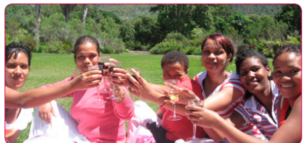
A toast to women everywhere!