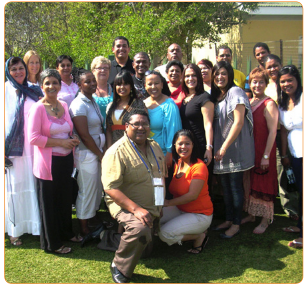
Delegates from the conference

South Africa's Deputy Minister of Social Development, Ms Bathabile Dlamini, wrapped up the conference with a call to action. "I urge the victims to report their aggressors, I entreat women to claim what is theirs and I encourage decent, law-abiding men and women of our country to work together to wage and win this war against gender-based violence and human trafficking."